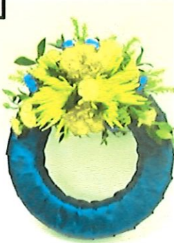
$64.95 12" Floral Wreath Personal Ribbon