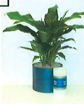
$59.95 6" Live Plant and 6" x 3" Personalized Candle (Yours to keep after the service)