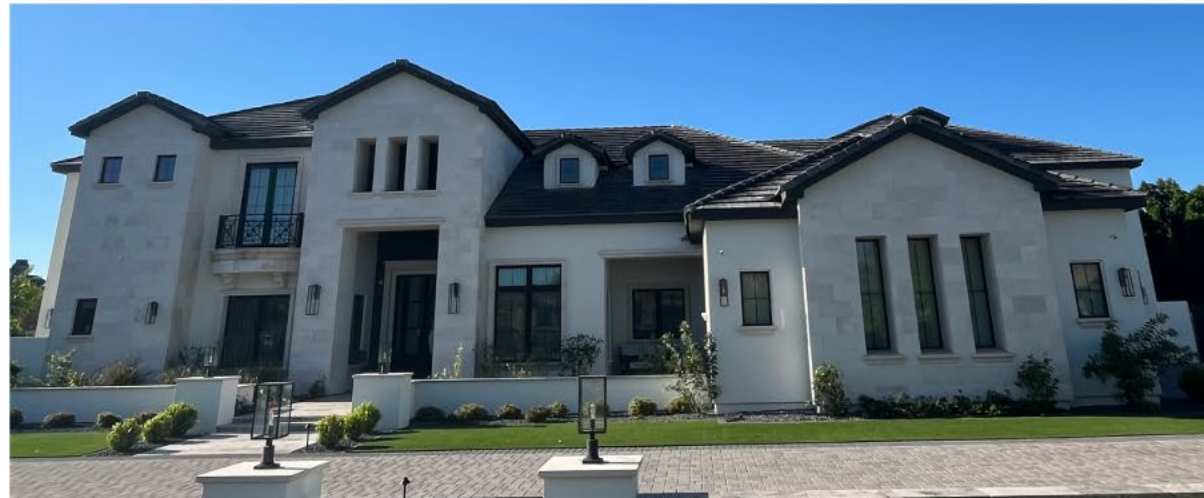
Heard Case Photos