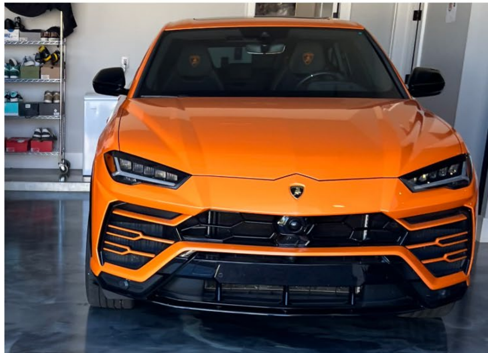
Heard Case Photos