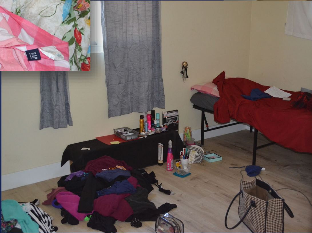
Sober Living Home Photos