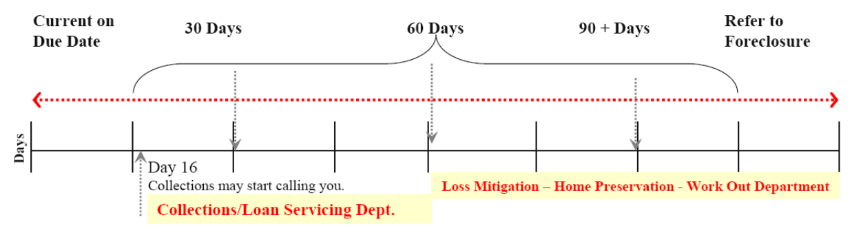
Diagram of Delinquency Process from Late to Auction Date – 180 days

This time line is for a typical scenario for a bank loan. Arizona law does not mandate the lender wait 90 days to file a Notice of Trustee's Sale. If a private investor wishes to foreclose, he can do so on the 1<sup>st</sup> day of the delinguency.