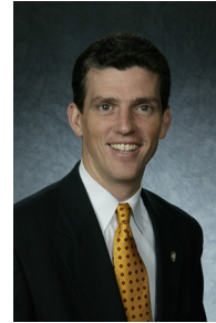
Attorney General Patrick Lynch

As co-chairs of the Task Force on School and Campus Safety formed by the National Association of Attorneys General (NAAG), we are pleased to present a report and recommendations for your consideration. With assistance from nationally recognized experts in the field of school and campus security, the Task Force examined a number of issues that have again been thrust upon the public consciousness as a result of the recent tragedy on the campus of Virginia Tech and incidents of violence at schools across the country.