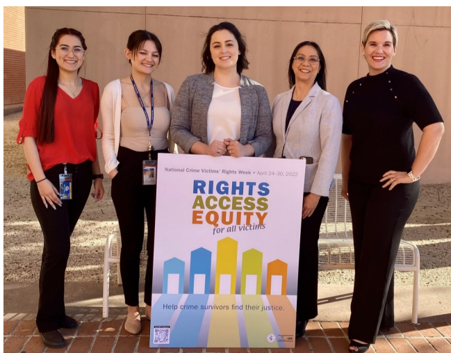
Pictured Above: Tucson's Victim Services staff.